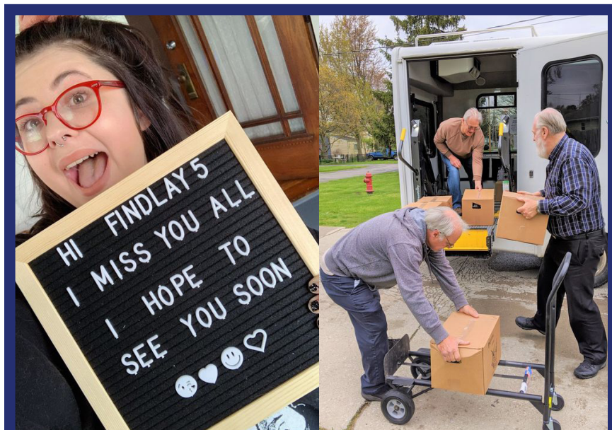
Left photo: Our Head Start classrooms shifted quickly to remote learning in 2020. Teachers sought creative ways to stay connected to students and families.

While it is likely we will need to continue to deal with the effects of the pandemic, we are hopeful that by the end of 2021 we will be able to return to some level of normalcy. As noted, many of our program areas have been granted a substantial amount of additional funding through various economic relief programs signed into law by Congress. We will continue to have a significant increase in activity around housing stability programs. We anticipate funding increases in virtually all program areas, as well as COVID-specific funding. While the added funding will come with additional challenges, we are very thankful for the opportunities that such funding will provide. In closing, we wish to thank all HHWP CAC staff, partner agencies, and all community stakeholders who help us to meet our mission to reduce the conditions of poverty by providing comprehensive services that improve lives.