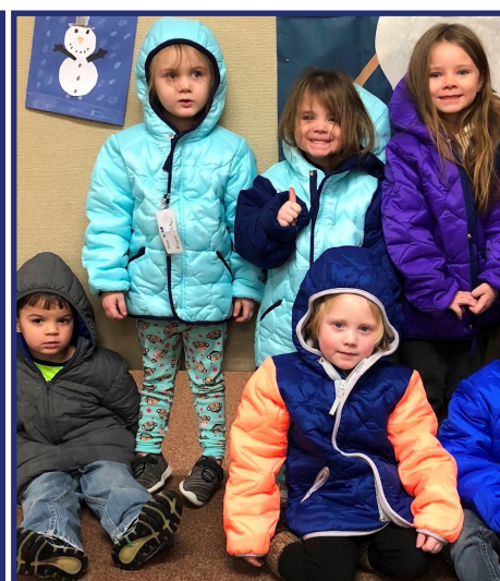
Left Photo: Students in Upper Sandusky's Head Start classroom celebrated the program's 5 star rating.