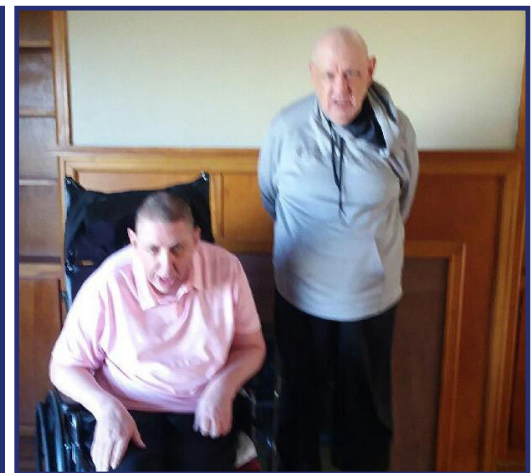
Left Photo: A wheelchair ramp was added to the most recent rental home in Wyandot County.